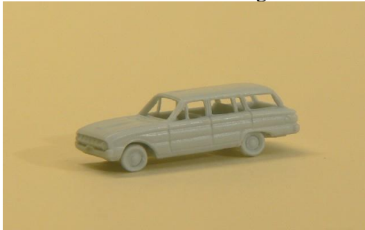
1960 Ford Falcon station wagon