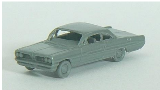
1961 Pontiac Ventura 2 door