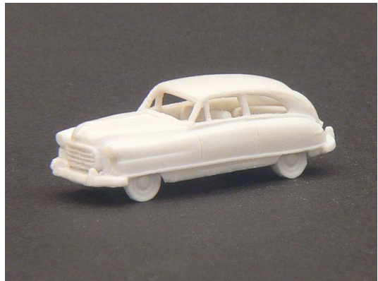
1950 Nash 2 door