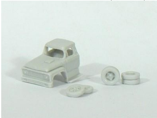
1968 Ford F850 cab/wheels ($3.00 ea)