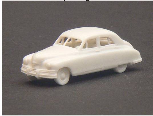
1948 Packard Super Eight sedan