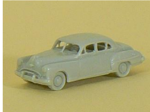
1949 Oldsmobile 4 door