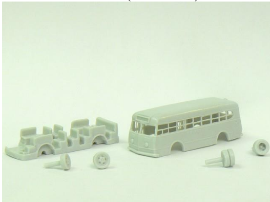
1940s Transit Bus ($12.00 ea)