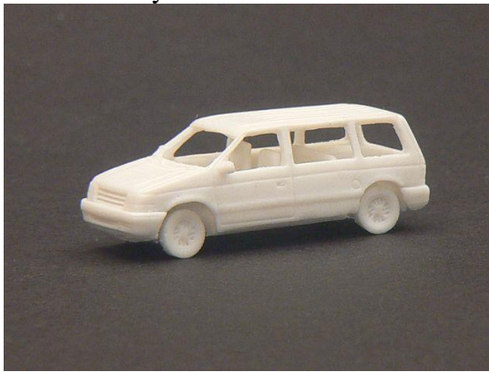
1991-95 Chrysler minivan