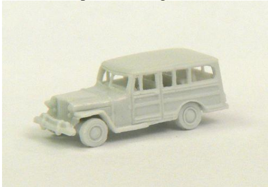
1949-52 Jeep station wagon