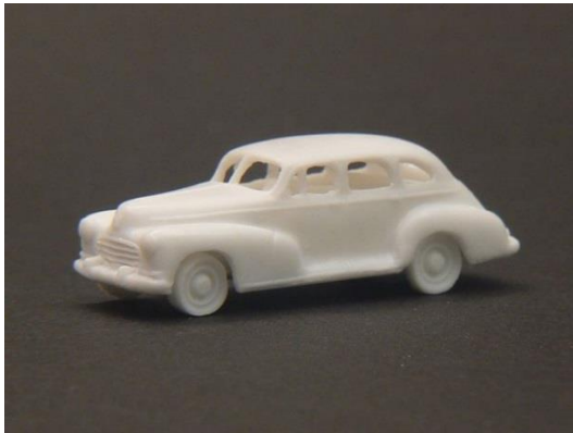
1946 Chevrolet 4 door sedan