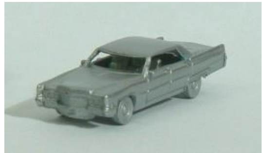
1969 Cadillac 4 door