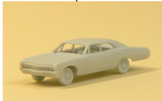
1967 Chevrolet Impala 4 door