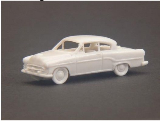
1954 Dodge Coronet 2 door