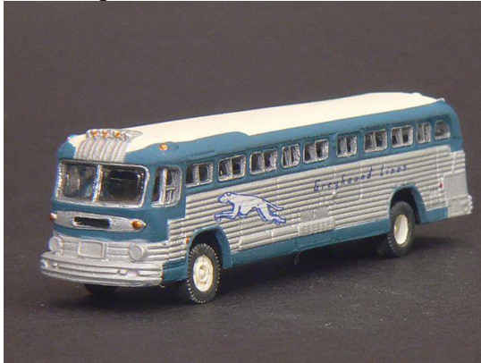
(Shown painted and assembled for reference)