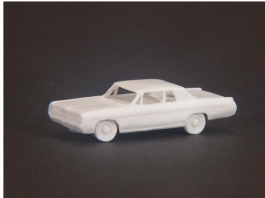
1963 Oldsmobile Starfire 2 door