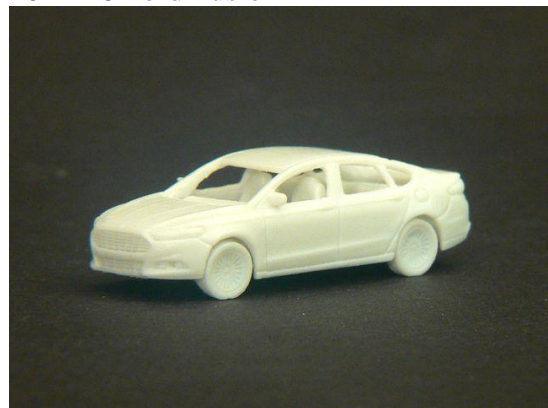
2012-16 Ford Fusion