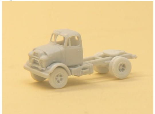
1958-62 GMC 860 single axle day cab ($6.00 ea)