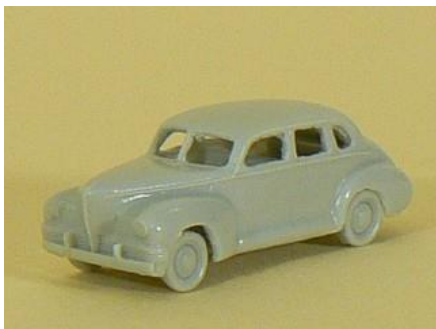
1941 Nash 4 door sedan