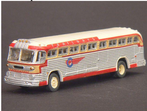
1951-53 GM PD4103 bus – Trailways ($16.00 ea) includes decals Shown painted and assembled for reference