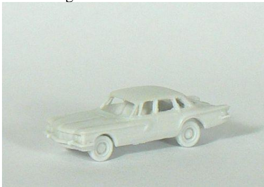
1961 Dodge Lancer 4 door