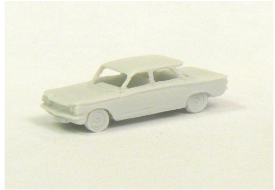
1960-64 Chevrolet Corvair 4 door