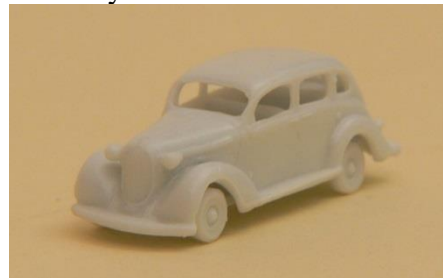
1938 Plymouth 4 door sedan