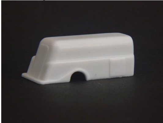
1940s fuel truck body – fits long wheelbase Ford/Chevy chassis listed above ($3.00 ea)