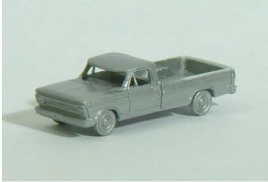
1968 Ford Pickup – 8ft bed