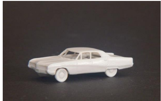
1967 Buick Electra 225 4 door