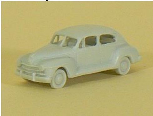
1946-48 Plymouth 2 door sedan