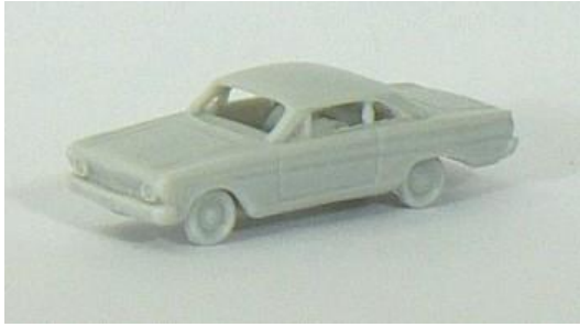
1964 Ford Falcon