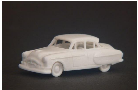
1953 Packard 4 door