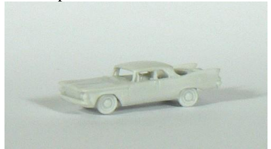
1961 Imperial 2 door