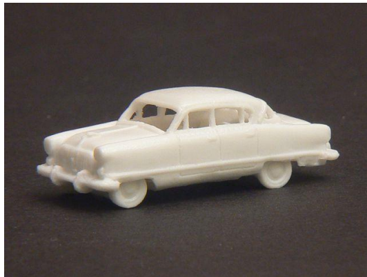
1952 Nash 4 door