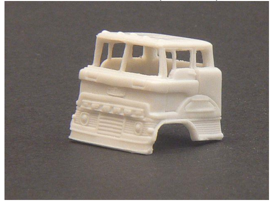
1961 Ford H series cab ($3.00 ea)