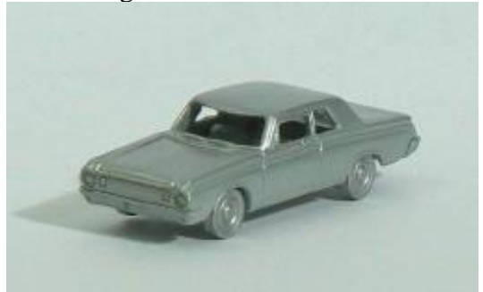
1964 Dodge 330