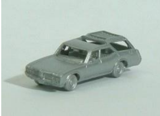
1971 Oldsmobile Vista Cruiser wagon