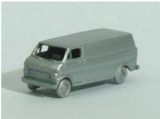
1972 Ford Econoline Van