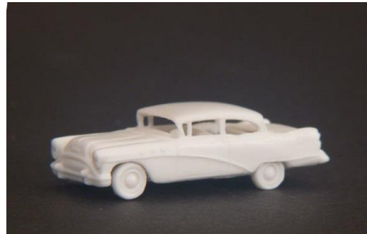
1954 Buick 2 door