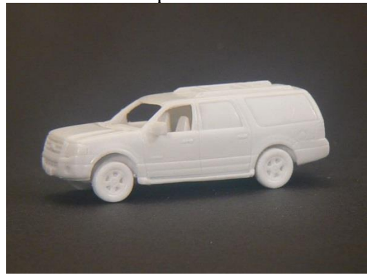
2007-17 Ford Expedition