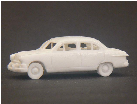
1951 Ford 4 door