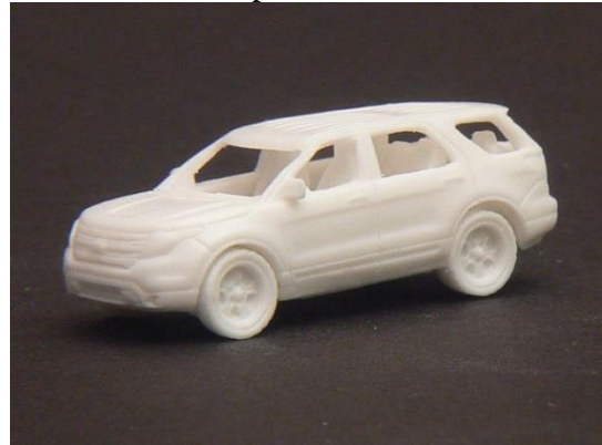
2011-15 Ford Explorer