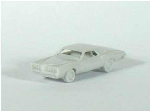
1973 Pontiac Grand Am