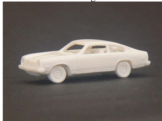
1976-77 Chevrolet Vega