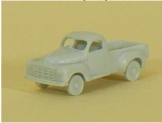
1949-53 Studebaker pickup