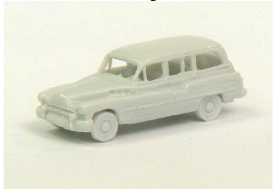
1950 Buick station wagon