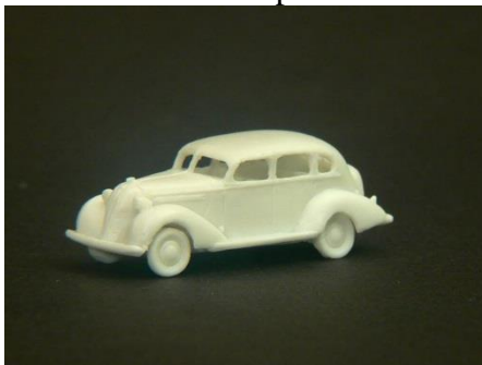
1937 Hudson Terraplane 4 door