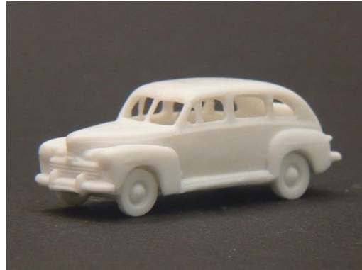
1946-47 Ford 4 door sedan