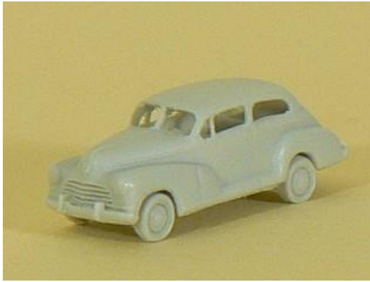
1946 Chevrolet 2 door sedan