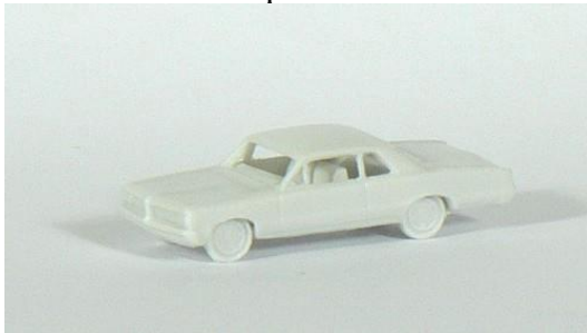
1964 Pontiac Tempest