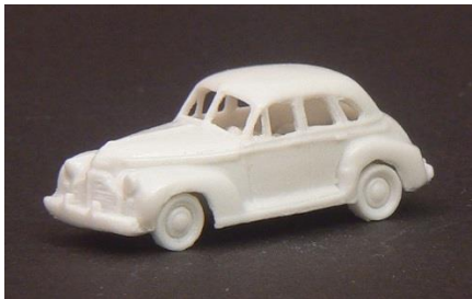
1941 Chevrolet 4 door sedan