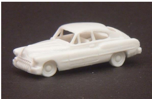
1950 Buick 2 door Sedanet