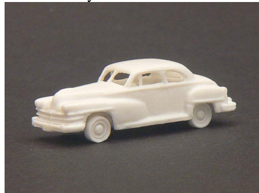
1946-48 Chrysler 2 door sedan