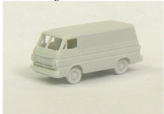
1965-69 Dodge A-100 van