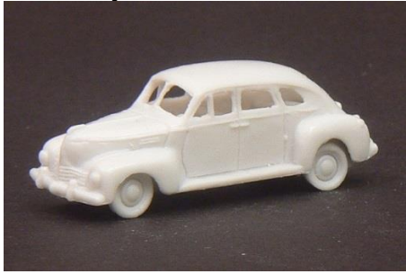
1940 Chrysler Windsor 4 door