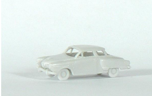
1950 Studebaker Starlight Coupe