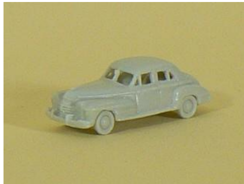
1941 Oldsmobile 4 door