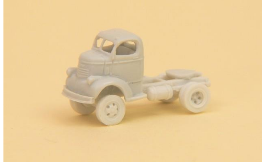
1941-47 Chevrolet COE semi tractor ($6.00 ea)