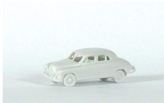
1947/48 Kaiser 4 door sedan