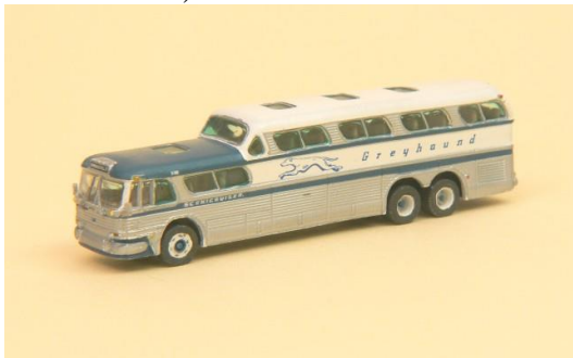
(Scenicruiser shown painted and assembled for reference)