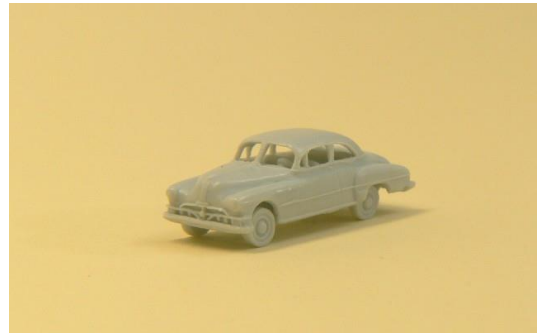
1951 Pontiac 2 door