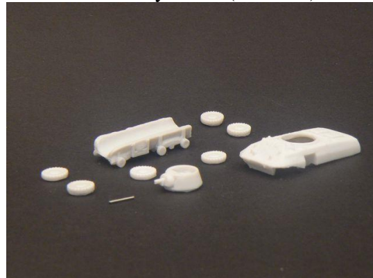
1943-45 M8 Greyhound ($6.00 ea)