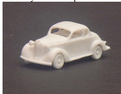
1938 Plymouth coupe