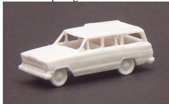
1965-69 Jeep Wagoneer