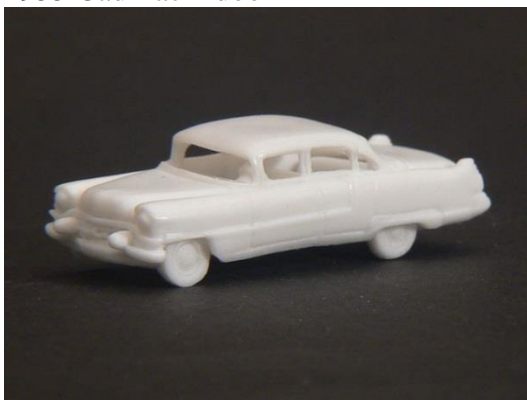
1955 Cadillac 4 door