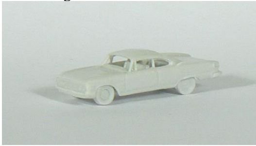
1961 Dodge Polara