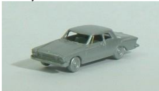
1962 Plymouth Belvedere