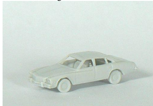
1975 Buick Regal 4 door