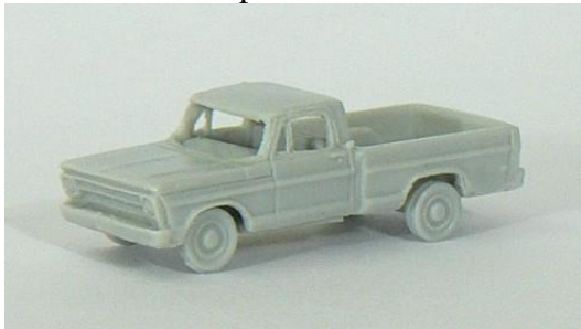
1968 Ford Pickup – 6ft bed