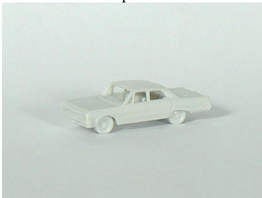
1964 Chevrolet Impala 4 door