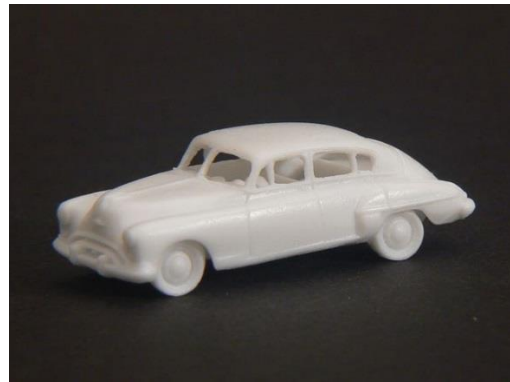
1949 Oldsmobile Town Sedan