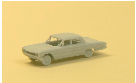
1961 Oldsmobile 88 4 door