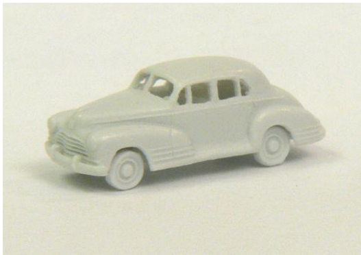
1946 Chevrolet Fleetline 4 door sedan