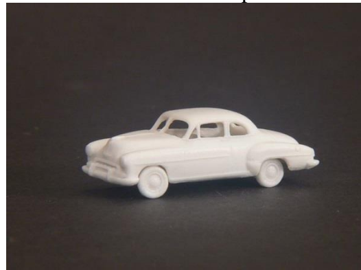
1952 Chevrolet 2 door coupe