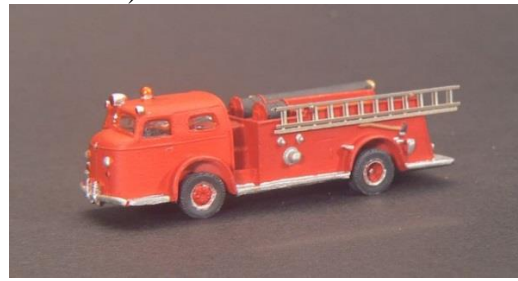
(Pumper shown painted and assembled for reference)