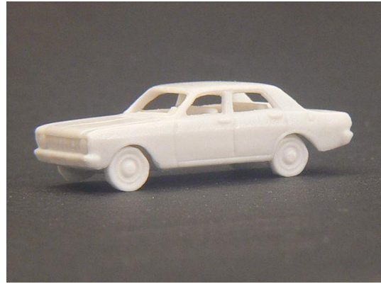
1966-67 Ford Falcon 4 door