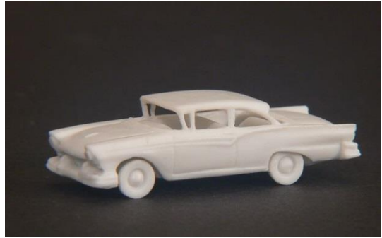
1957 Ford Fairlane 2 door