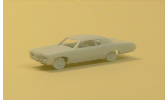
1970 Chevrolet Impala 2 door