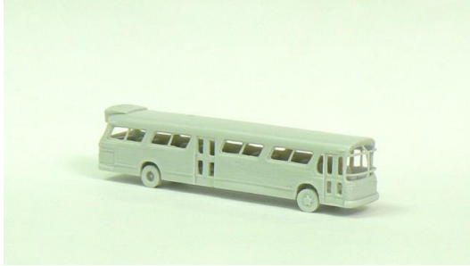
1959-86 GM TDH-5301 "Fishbowl" Bus ($8.00 each)