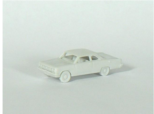
1965 AMC Rambler 2 door