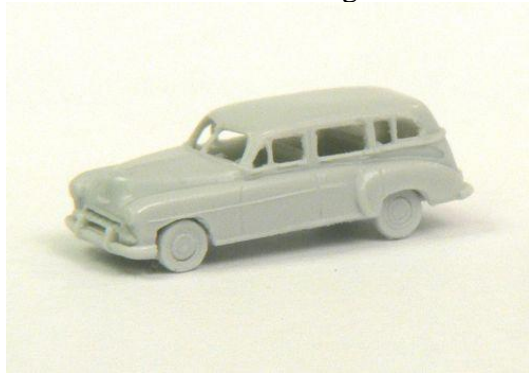
1952 Chevrolet station wagon