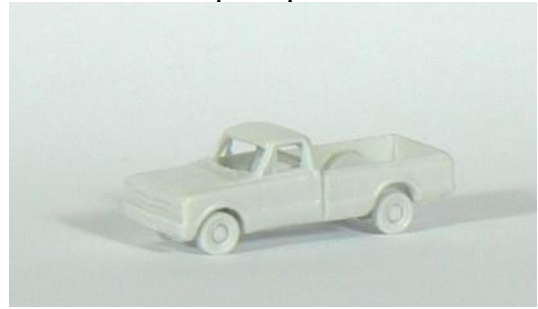
1968 Chevrolet pickup