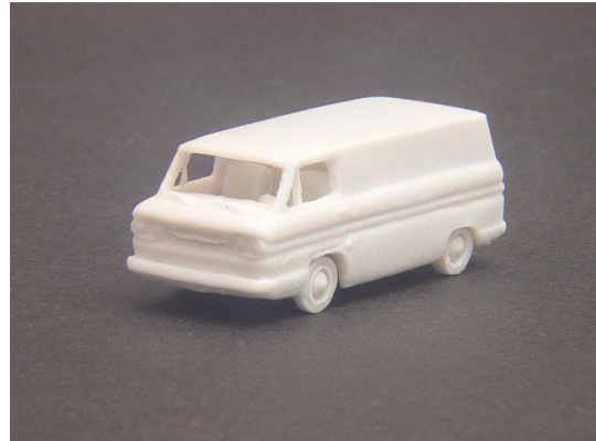
1960-64 Corvair 95 Panel Van