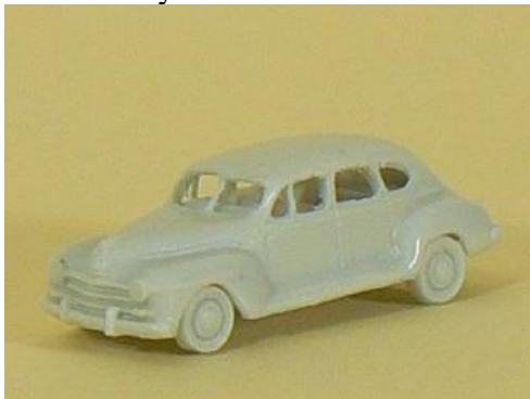
1946-48 Plymouth 4 door sedan