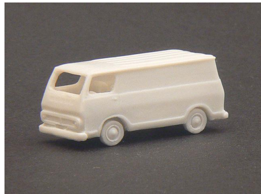
1967 Chevrolet Van