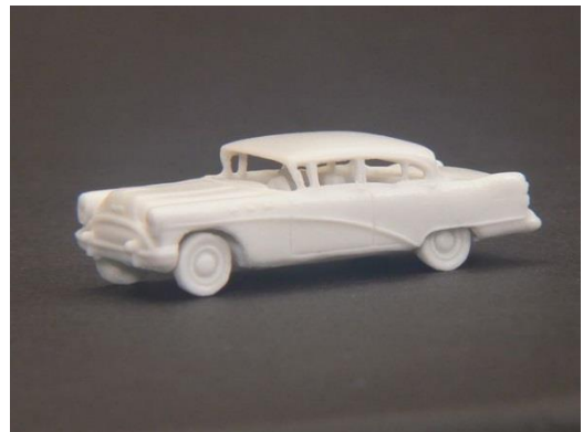
1954 Buick 4 door