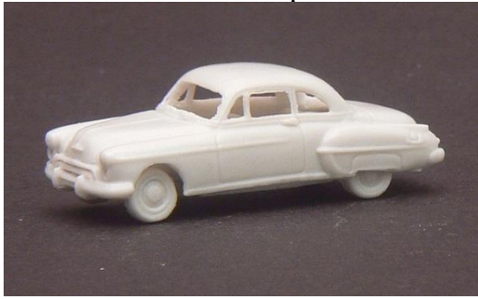
1950 Oldsmobile 88 coupe