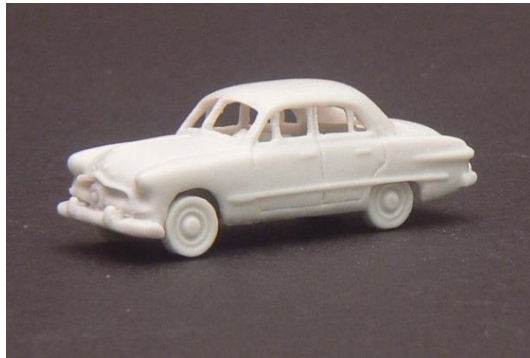
1949-50 Ford 4 door sedan