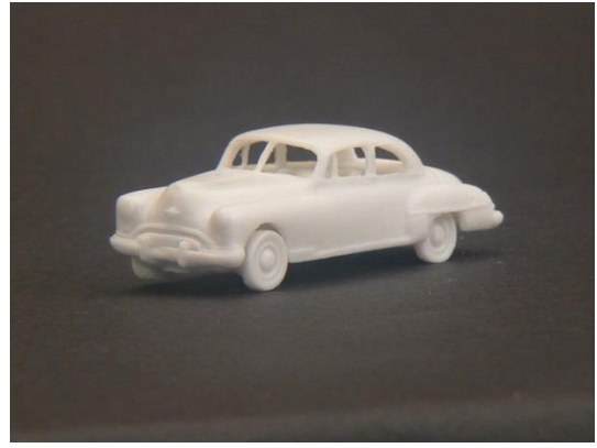
1949 Oldsmobile 2 door sedan