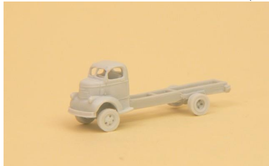
1941-47 Chevrolet COE cab /chassis ($6.00 ea)