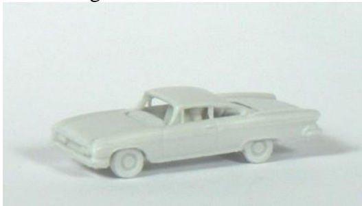
1961 Dodge Dart