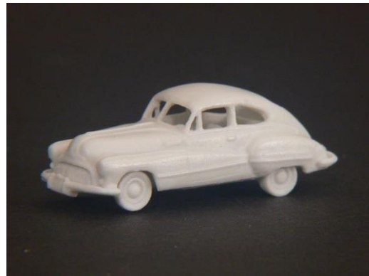
1947 Buick 2 door Sedanet