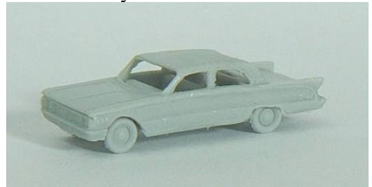
1961 Mercury Comet 4 door