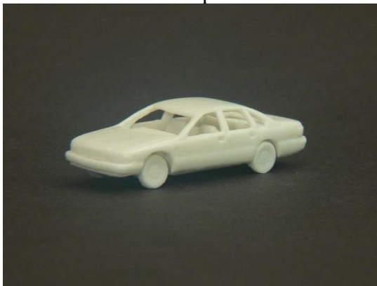
1995-96 Chevrolet Caprice