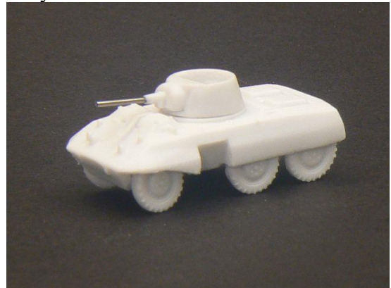
Greyhound shown assembled for reference: