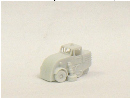
1950s Pelican Style Street Cleaner ($6.00 ea)