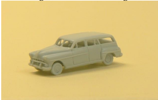
1951 Dodge Coronet station wagon