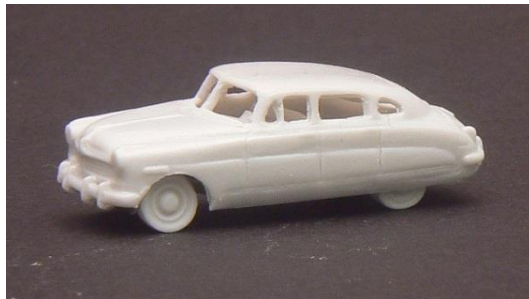
1949 Hudson Commodore