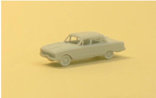
1960 Ford Falcon 4 door