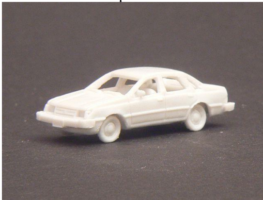
1984-85 Ford Tempo 4 door