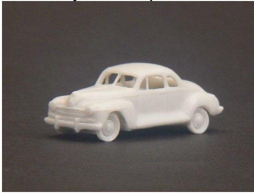
1946-48 Plymouth coupe