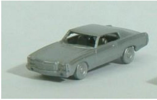
1970 Chevrolet Monte Carlo