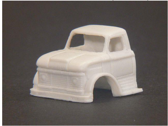
1963-70 Ford N series cab ($3.00 ea)