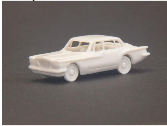
1961 Plymouth Valiant 4 door