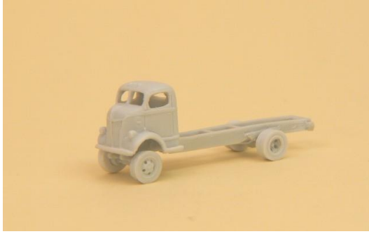
1941-47 Ford COE cab and chassis ($6.00 ea)