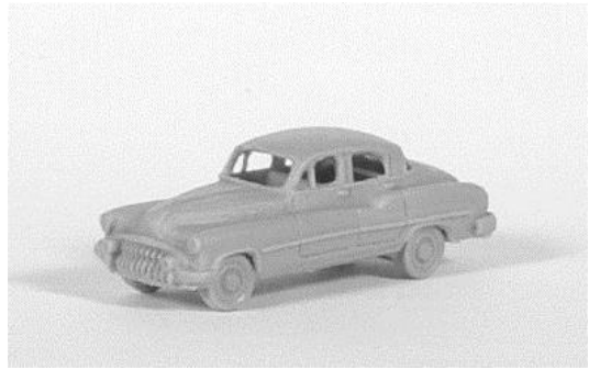
1950 Buick 4 door