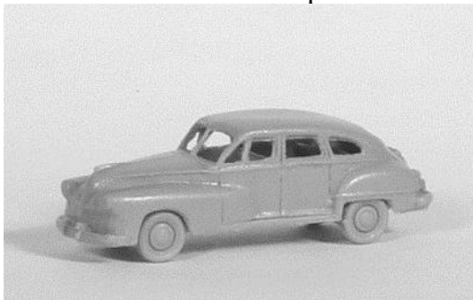
1946 De Soto Suburban 7 pass sedan