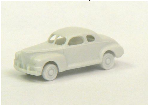
1941 Nash 2 door coupe