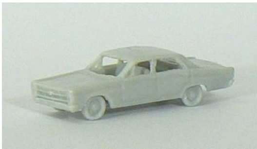
1966 Ford Fairlane 4dr