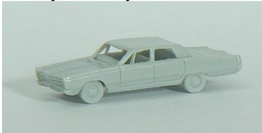
1967 Plymouth Fury 4 door