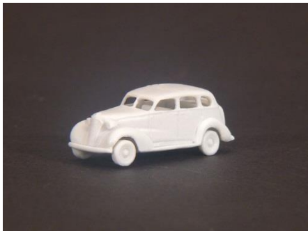
1937 Chevrolet 4 door sedan