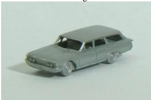
1960 Ford Galaxie wagon