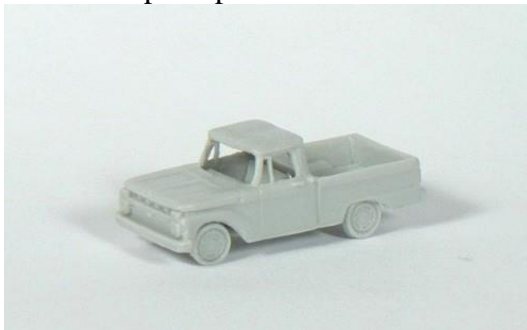
1961 Ford pickup