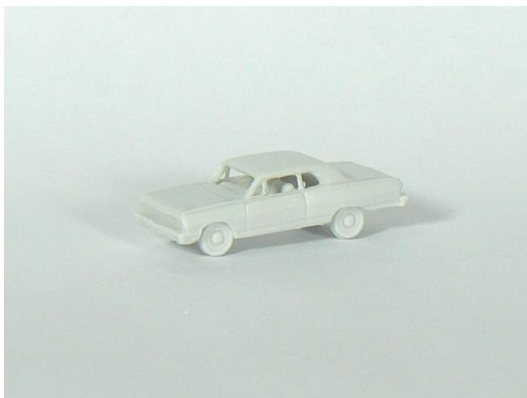
1964 Chevrolet Malibu 2 door