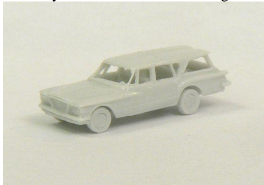
1961 Plymouth Valiant station wagon