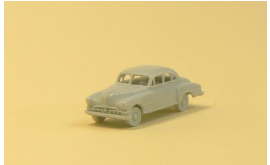
1951 Pontiac 4 door