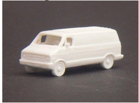
1974-78 Dodge van