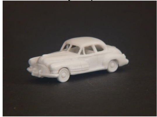
1942 Buick Utility Coupe