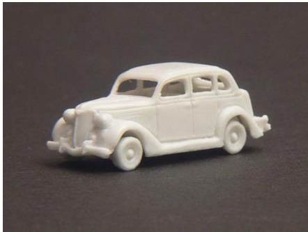
1936 Ford 4 door sedan