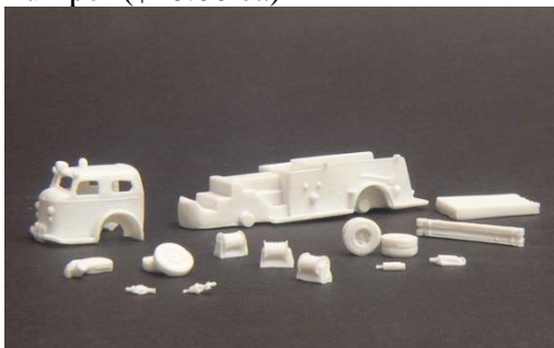
1947-49 American La France 700 series Pumper ($10.00 ea)