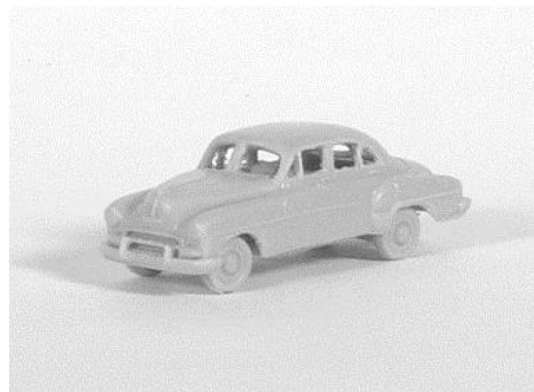
1952 Chevrolet 4 door sedan