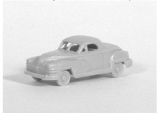
1946-48 Chrysler Business Coupe