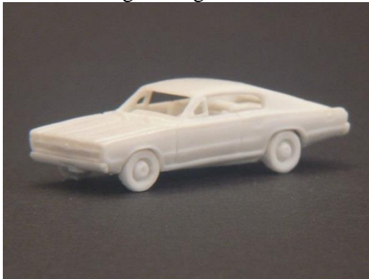
1966-67 Dodge Charger