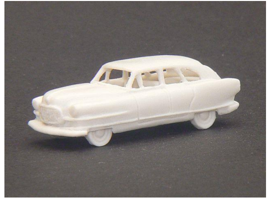
1951 Nash 4 door