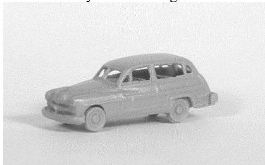
1949 Mercury Station Wagon