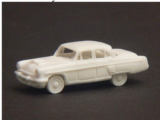
1953 Mercury 4 door