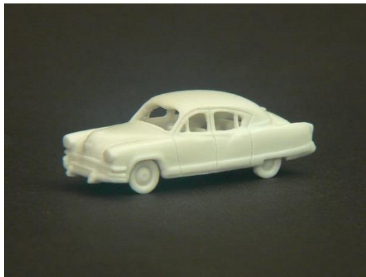
1953 Kaiser Manhattan 4 door