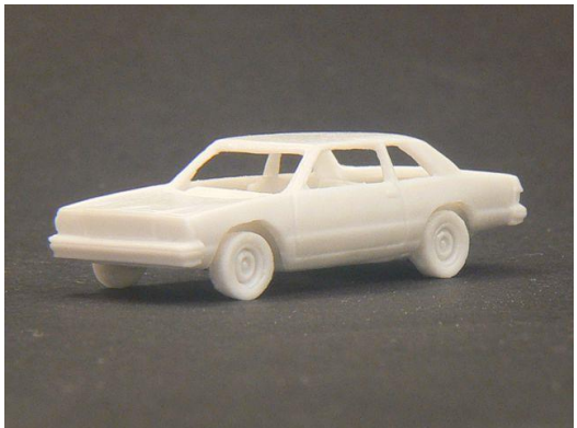
1978-83 Chevrolet Malibu