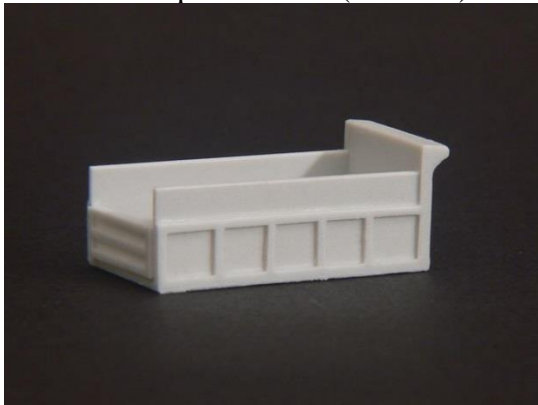
Generic Dump Truck bed ($3.00 ea)